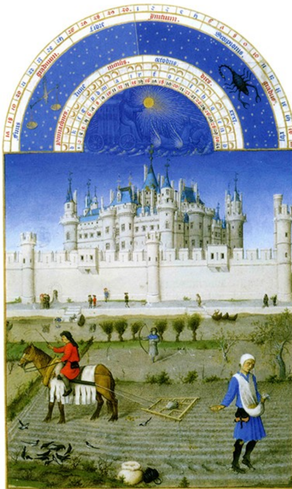
035. THE TRÈS RICHES HEURES OF JEAN, DUKE OF BERRY c. 1410–16 / Paris / 294 x 210 mm / Folio 10 verso

In this miniature by the Limbourgs representing the month of October, the Louvre, then the residence of the kings of France, stands on Paris' right bank, across the Seine from the farming scene in the heart of Paris in the foreground. The figures at the bottom plow the field and plant the seeds while in the middle distance a scarecrow archer and network